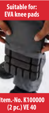
Suitable for: EVA knee pads Item.-No. K100000 (2 pc.) VE 40