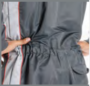
ADJUSTABLE WAIST ELASTIC FOR OPTIMAL FIT