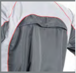
VENTILATION COLLAR ON THE BACK