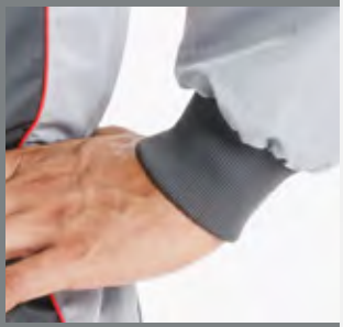
SOFT KNITTED CUFFS ON THE WRIST