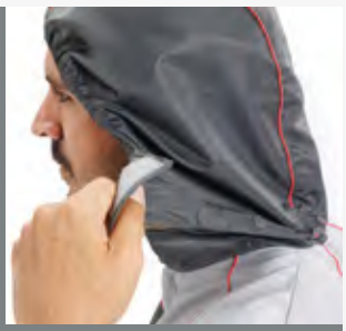
REMOVEABLE HOOD WITH ELASTIC BAND AND VELCRO