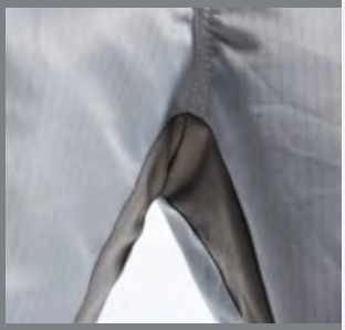
BREATHABLE & STRETCHY FABRIC INSERT IN THE CROTCH