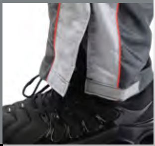
LEG OPENING WITH VELCRO FASTENER AT THE ANKLE